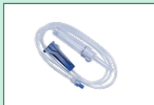
Any IV Set

An infusion pump that serves both volumetric & drop counting function