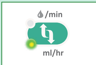
Drop/min & ml/hr