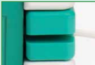
Avoid Air Embolism