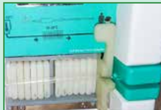
Free Flow Protection